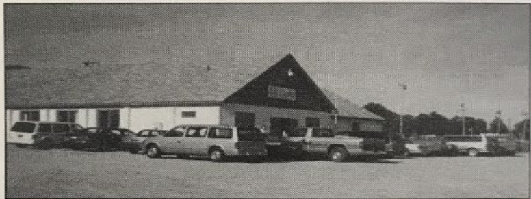
4-H Center, Emmet County Fairgrounds

The first worship service was held March 12, 1989 at the 4-H Center of Emmet County Fairgrounds. This facility would serve as the regular place of worship till October of 1996. Occa-