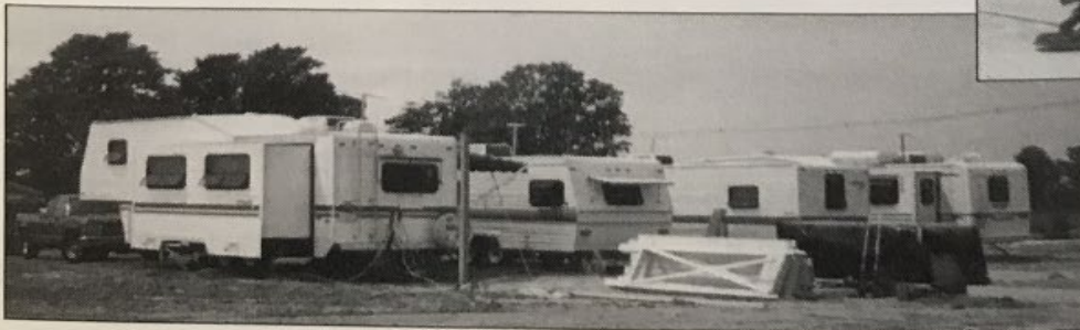
RV's were a common sight during construction.